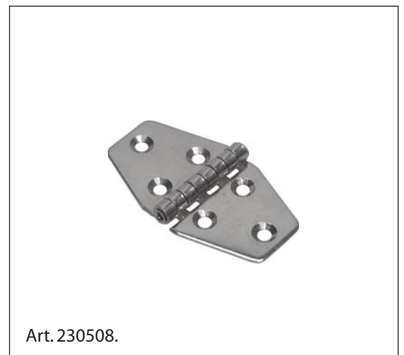
Hinge, Stainless Steel 1.4301