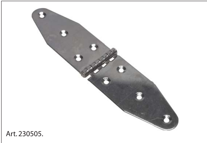
Hinge, Stainless Steel 1.4301