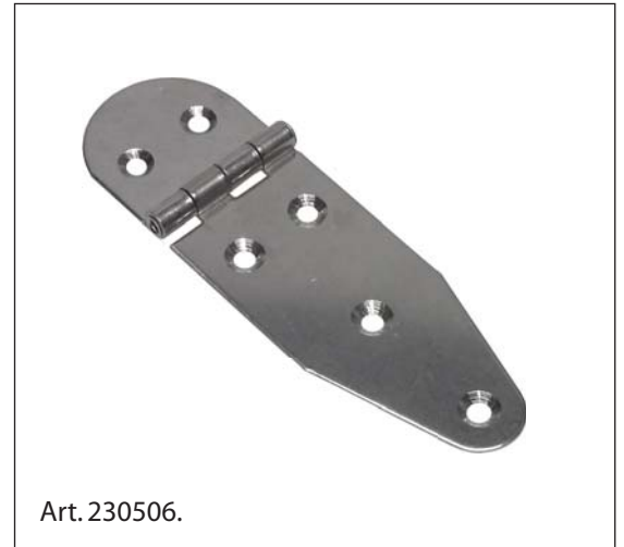
Hinge, Stainless Steel 1.4301