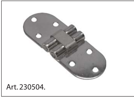
Table hinge, Stainless Steel 1.4301