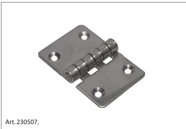
Hinge, Stainless Steel 1.4301